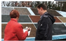
COLOR SHOWN: Autumn Brown